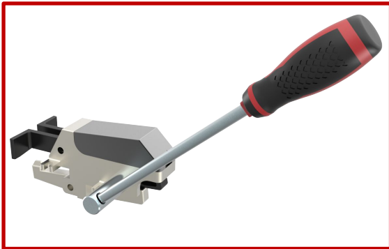
Powerful breaking system