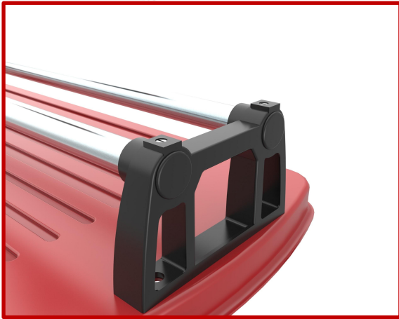
Screws for fixing the rails