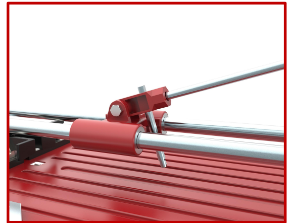
Visible pen style cutting wheel